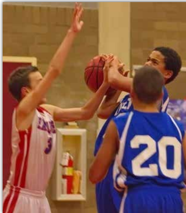
More photos on page 8.