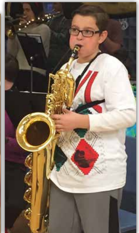
More photos on page 3.

The Einstein News , a joint publication of Einstein Middle School and the Einstein Middle School PTSA, is published monthly during the school year. Next issue 2/1/16, deadline 1/21/16. Send text in an email or as a .doc to einsteinmiddleschoolnews@gmail.com .