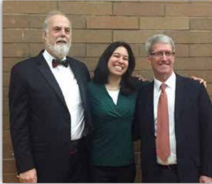
The school celebrated the season with an assembly before Winter Break.