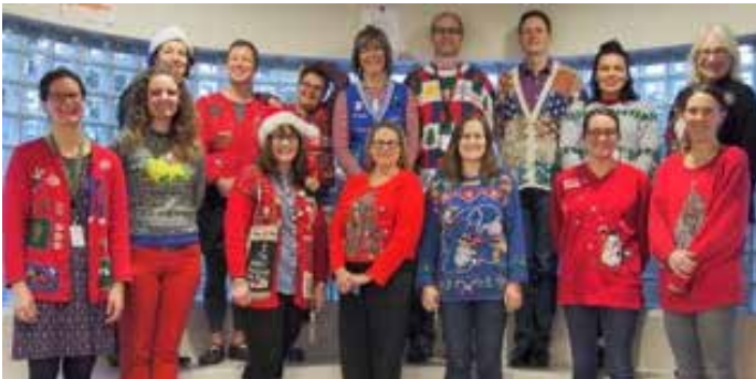
Einstein Staff celebrating Ugly Sweater Day!

The deadline for submission is March 1, 2016 and awards will be presented at the 2016 WSPTA Convention, held May 20–22, 2016 in Yakima.