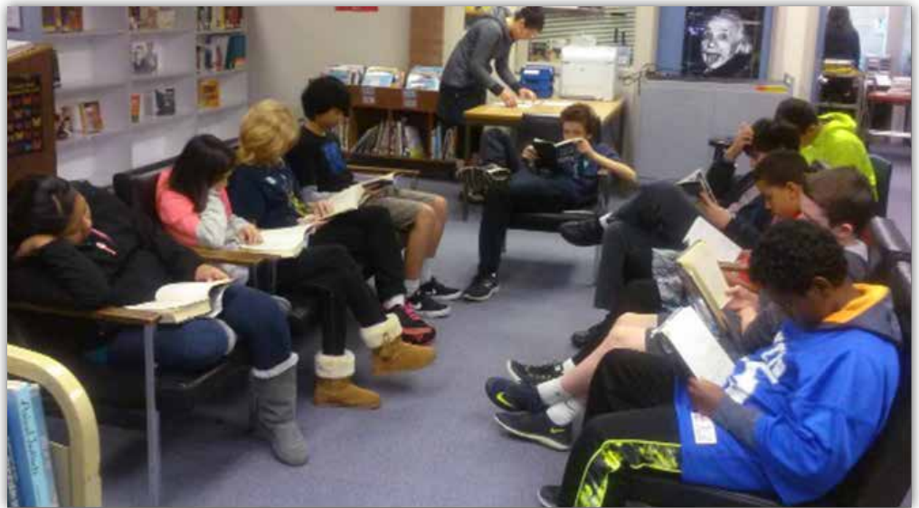
Einstein Tigers are Readers!