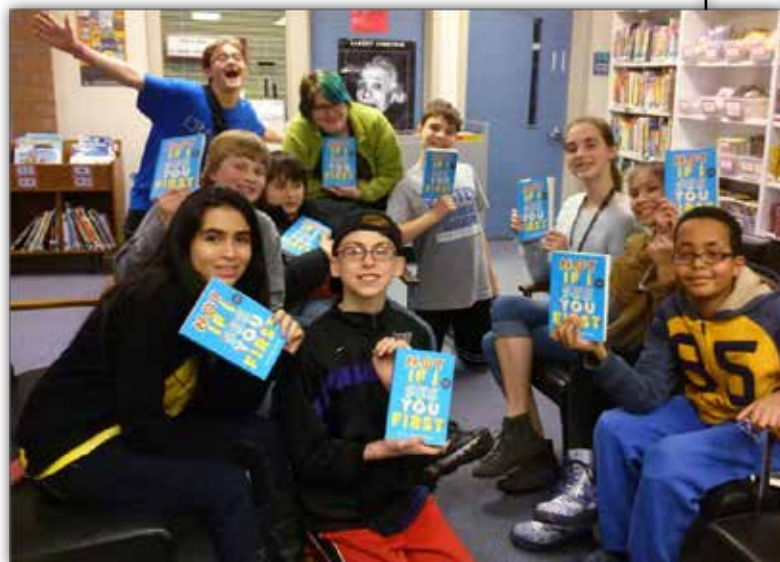
Pizza & Books read "Not If I See You First" by Eric Windstrom