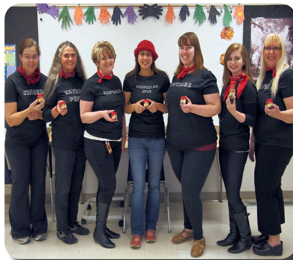
McCormick Spice Girls

Raffle tickets & prizes just for showing up in November! Get double tickets if it's your first time attending! Raffle drawing on November 26th. Come for the awesome snacks, stay for the fun! Play ping pong, sports, or games, or just kick it with your friends listening to the music. Check the daily bulletin for the calendar of activities. It's all free!