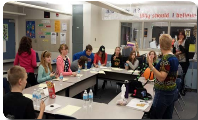
The First Meeting of The Write Stuff