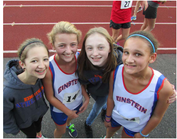
Members of the Girls Track Team

For the last four years we have made steady gains in the area of science and math. Last year 83.5% of our students met the state standard in science and 74% of our students met or exceeded the state standard in math. Our science and math teachers have worked hard to provide your child with excellent opportunities in science and math. The math and science teachers continue to work together to help students develop a deeper understanding of science and math concepts, build confidence in their ability, and stimulate their interest and passion for the subject area.