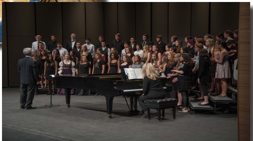
Performing Arts Auditorium