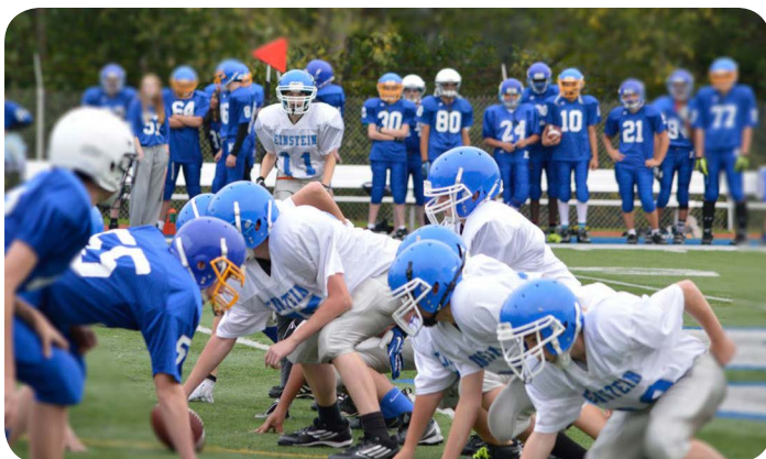
2013-14 Einstein Football Team

Sign up now! Registration forms are due THIS THURSDAY, SEPTEMBER 4TH!