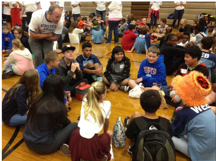
Welcome class of 2020