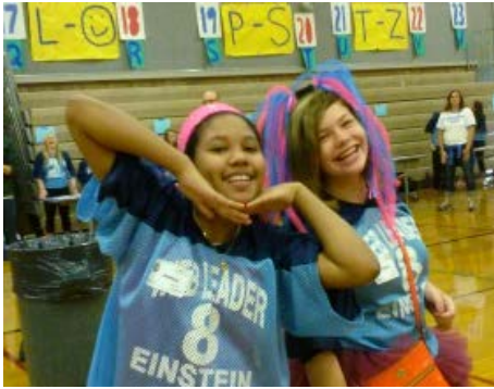
WEB Leaders welcome 7th graders!