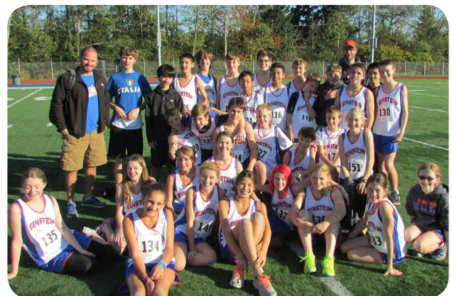
2013-14 Einstein Track Team