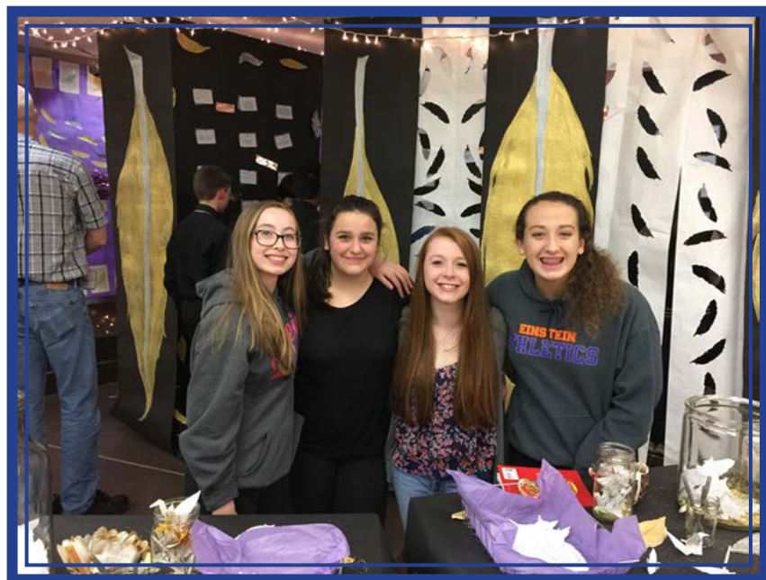
Pop-Up Community Art Project at EMS Open House