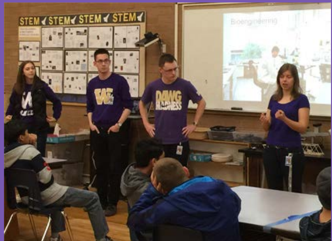
UW Engineering Students work with Einstein Engineering students.