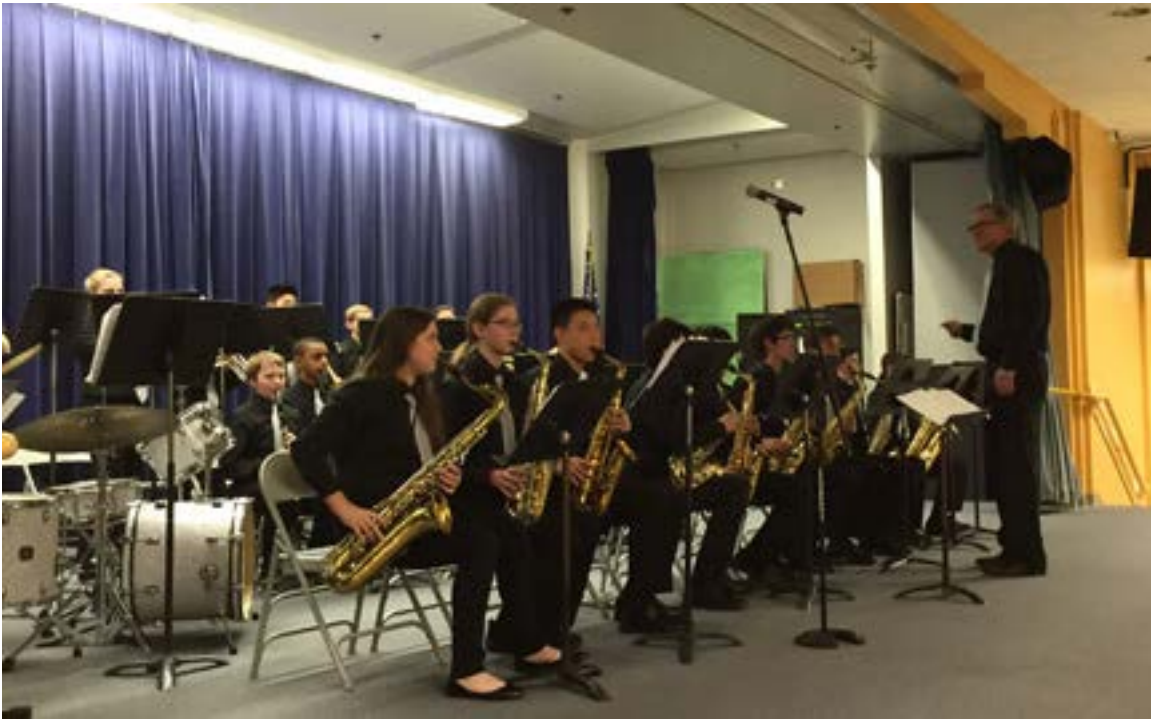
Jazz Band performs at the Spring Open House.